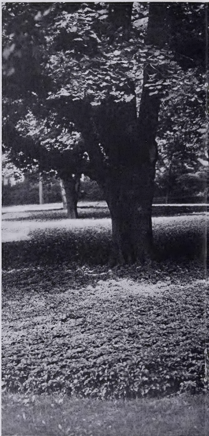
A Green Rug for the O Pachysandra and Trees, both recei